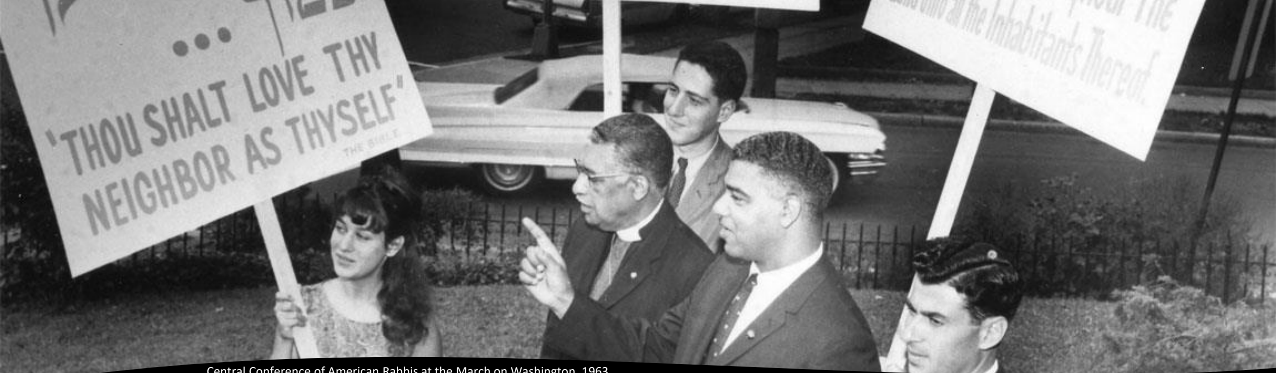
Central Conference of American Rabbis at the March on Washington, 1963